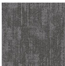
Network 67535 LRV 16.5