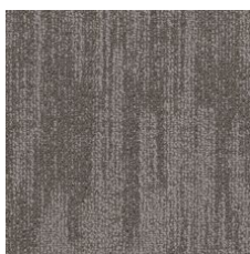
Interaction 67515 LRV 19.6