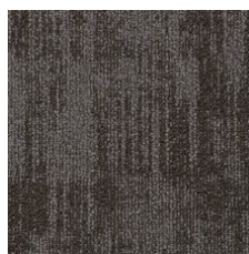
Link 67555 LRV 9.7